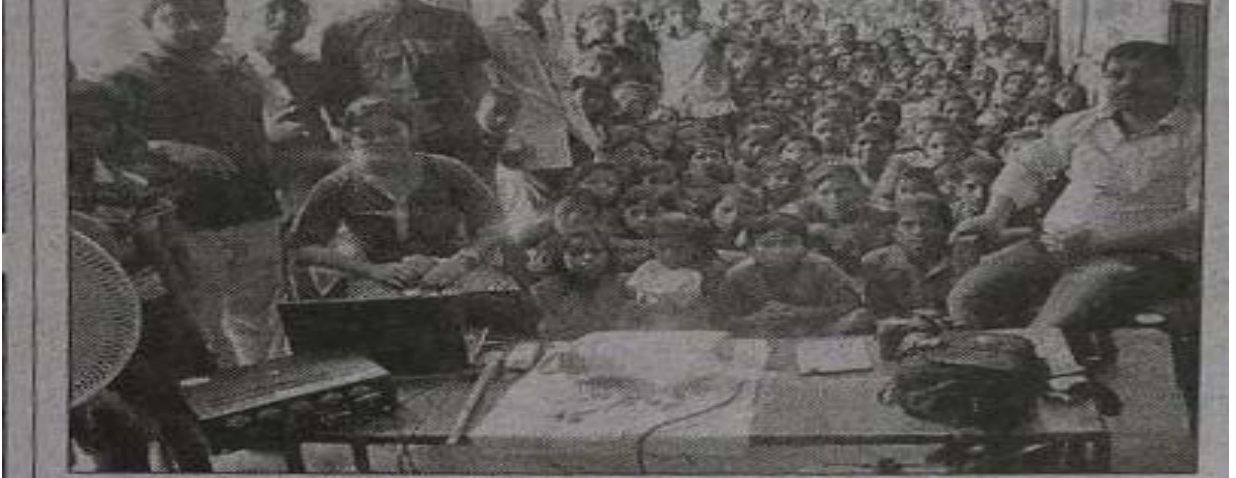
घेलाढ़ में बाल फिल्म देखते दुर्गा मध्य विद्यालय के बच्चे।